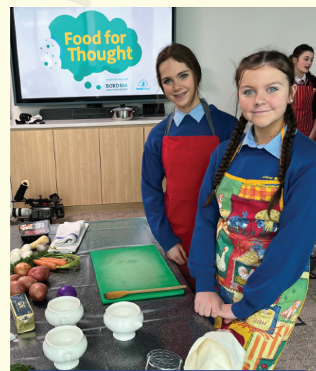
Bord Bia Food For Thought Programme

There are a wide variety of extra-curricular activities in the school in which students are encouraged to take part. Traditionally hurling and football have been the main school sports. However, today the focus is much wider with activities such as: Soccer, Basketball, Athletics, Camogie, Debating, Traditional Music, Choir, Ag Science Farm Visits, Career Exhibitions, Well-Being Workshops, Senior Science Quizzes, Charity Work, Mini-Company, educational trips and foreign school tours.