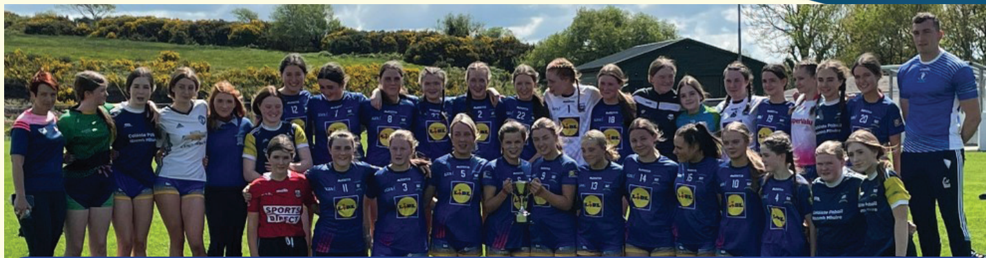
2023 Junior Ladies Football County Champions two years in a row and 2023 Senior Munster Champions