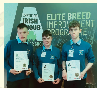
Certified Irish Angus Beef Schools Competition