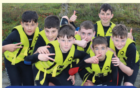
Buddy Bonding Trip