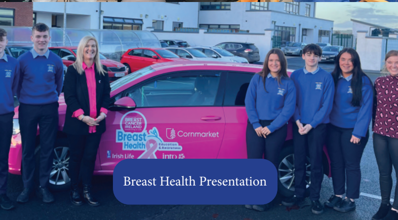
Breast Health Presentation