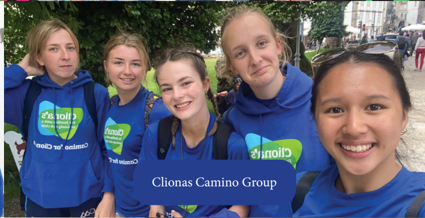
Clionas Camino Group