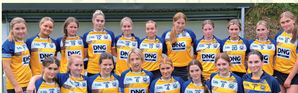
After School Training