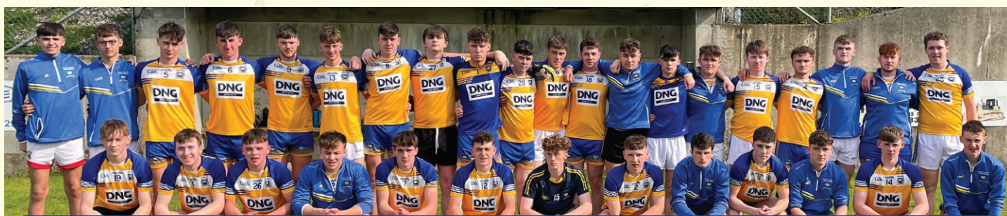
Senior Boy's County Finalists