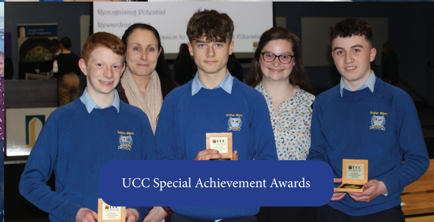
UCC Special Achievement Awards