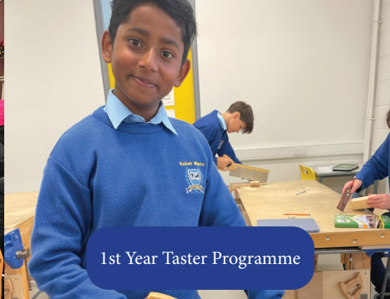
1st Year Taster Programme