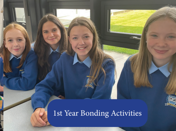
1st Year Bonding Activities